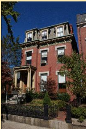
Bird House, 820 W. Franklin St.