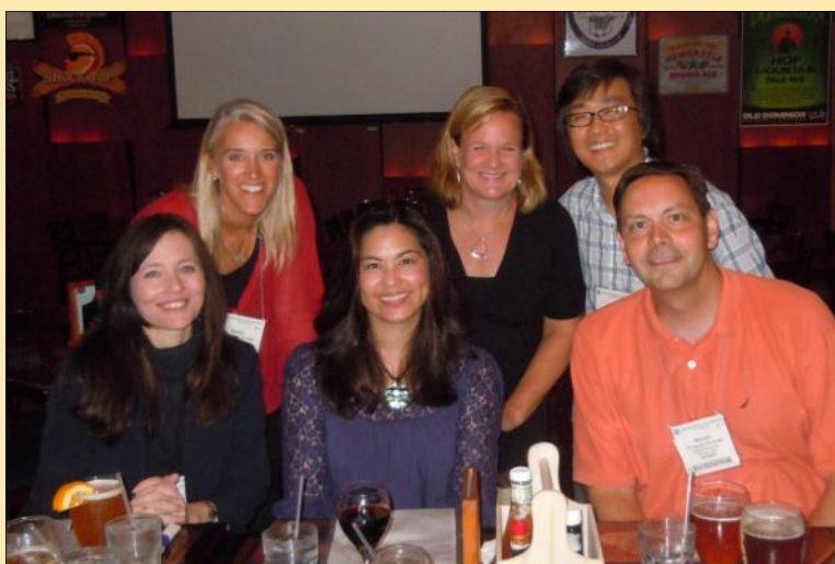
Six doctoral program alumni from the '90s found time recently to catch up over lunch at the American Psychological Association's annual convention for 2011 in Washington, D.C. (See updates within)